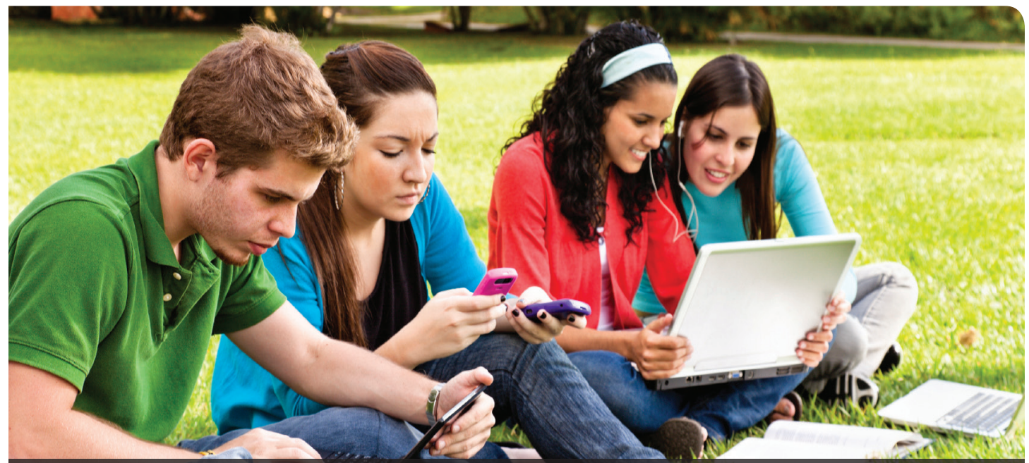
Now that you know why many students like learning online, you will find answers to some of your other questions in the sections that follow. This brief list of terms may be helpful as you investigate online learning.